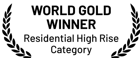
World Gold Winner trophy for Parc3 in the Residential High Rise category.