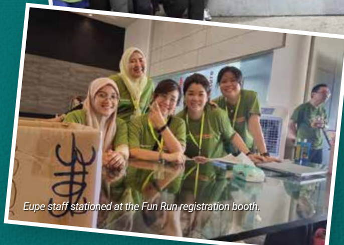
Eupe staff stationed at the Fun Run registration booth.

In line with Eupe's "Building Strong Communities" philosophy, the 5-kilometer run was held to raise money for programs and organisations that uplift the surrounding community, provide support to the disadvantaged or carry out initiatives to restore nature.