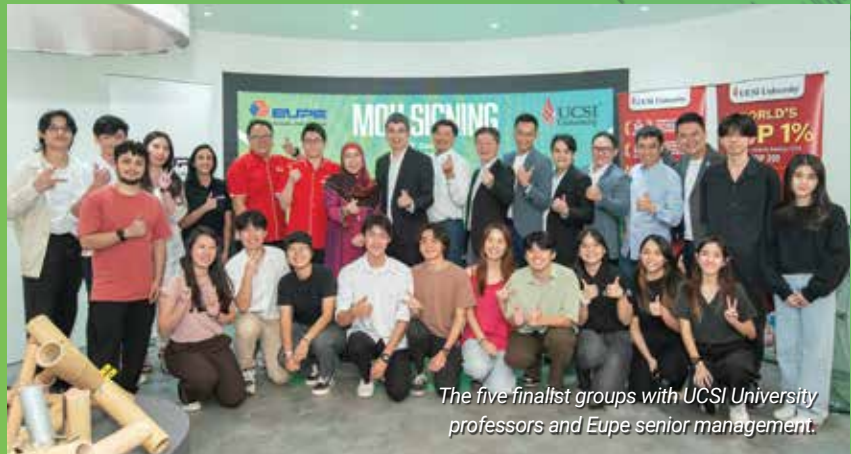
The five finalist groups with USCI University professors and Eupe senior management.