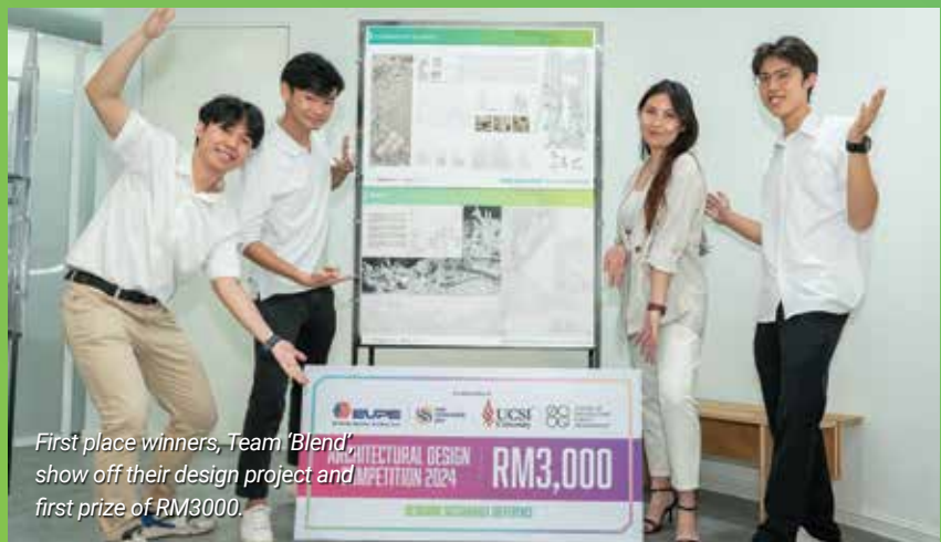
First place winners, Team 'Blend', show off their design project and first prize of RM3000.

The winning team 'Blend', who were one of the five shortlisted teams, won RM3000 as the first prize and also received the opportunity to learn alongside Eupe team during the construction process of the sales gallery.