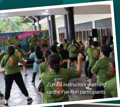
Zumba instructors warming up the Fun Run participants.